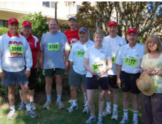
Great performance team and, yes, Cardiac Rehab was number one again as a group entry.