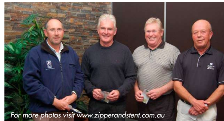
For more photos visit www.zipperandstent.com.au